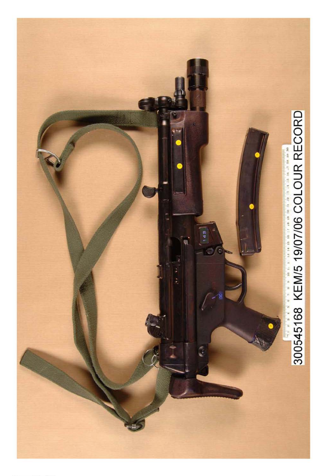
Page 8 of 8